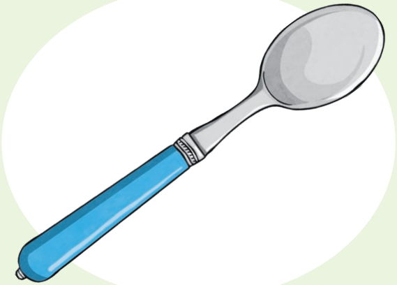
Stainless steel utensils